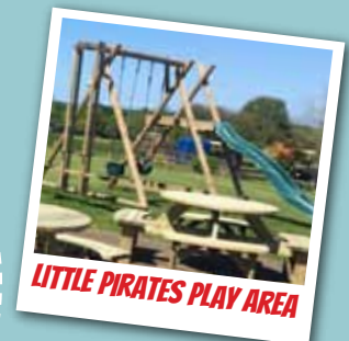
LITTLE PIRATES PLAY AREA